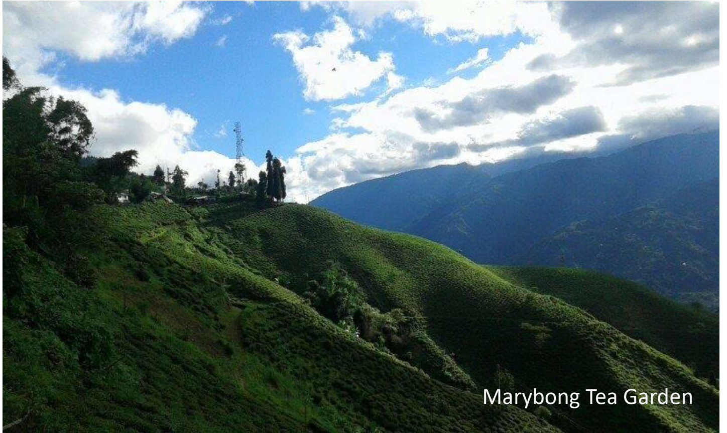
Marybong Tea Garden